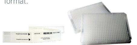
LightRun 96 Barcodes

Use our LightRun 384 Echo Plate for submitting your samples in 384 well format.